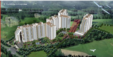
➤ The Infinite birds eye view